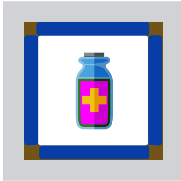
REGIONAL EPS Solutions