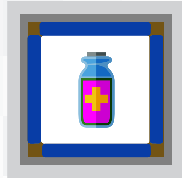
GLOBAL EPS + VIP Solutions