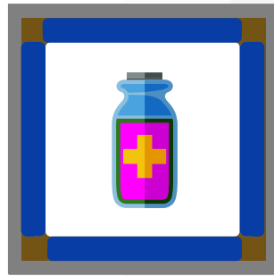
COMPACT VIP Solutions