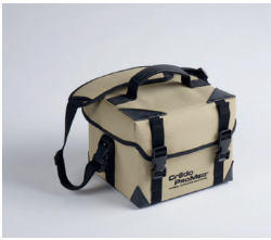
2 LITRES PAYLOAD