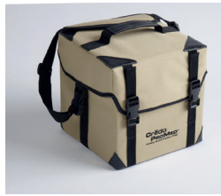
4 LITRES PAYLOAD