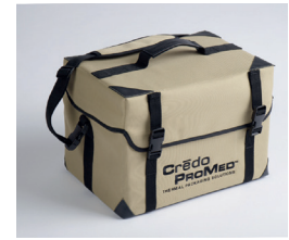
8 LITRES PAYLOAD